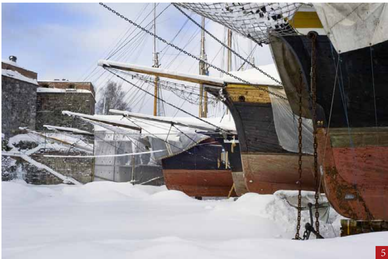
Although everything seems quite still, work in the basin goes on