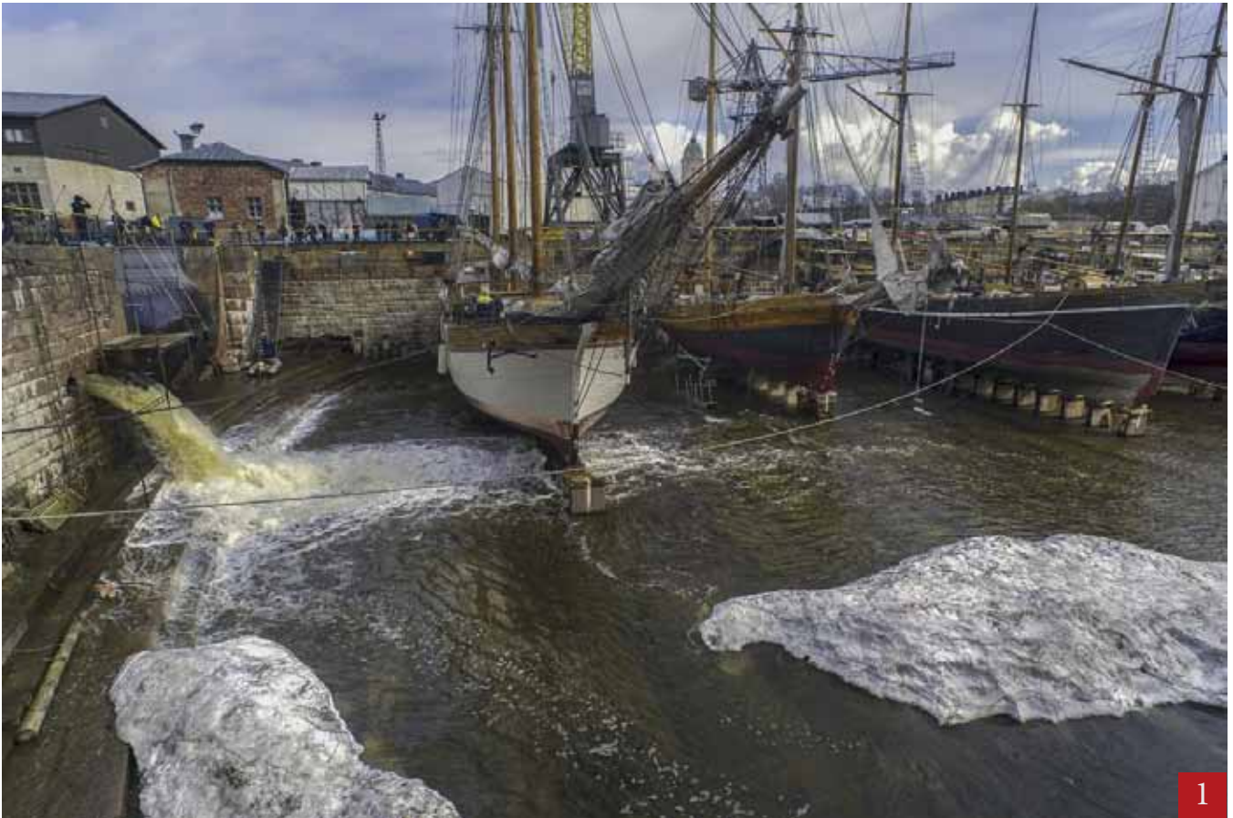
It's Spring! Water flows into the dock, soon the ships will be free