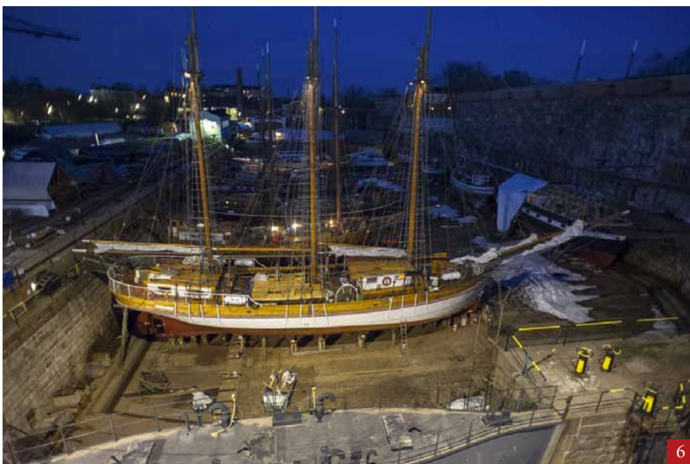
Time is tight; in a few days the dockyard will be flooded. Ships must get ready