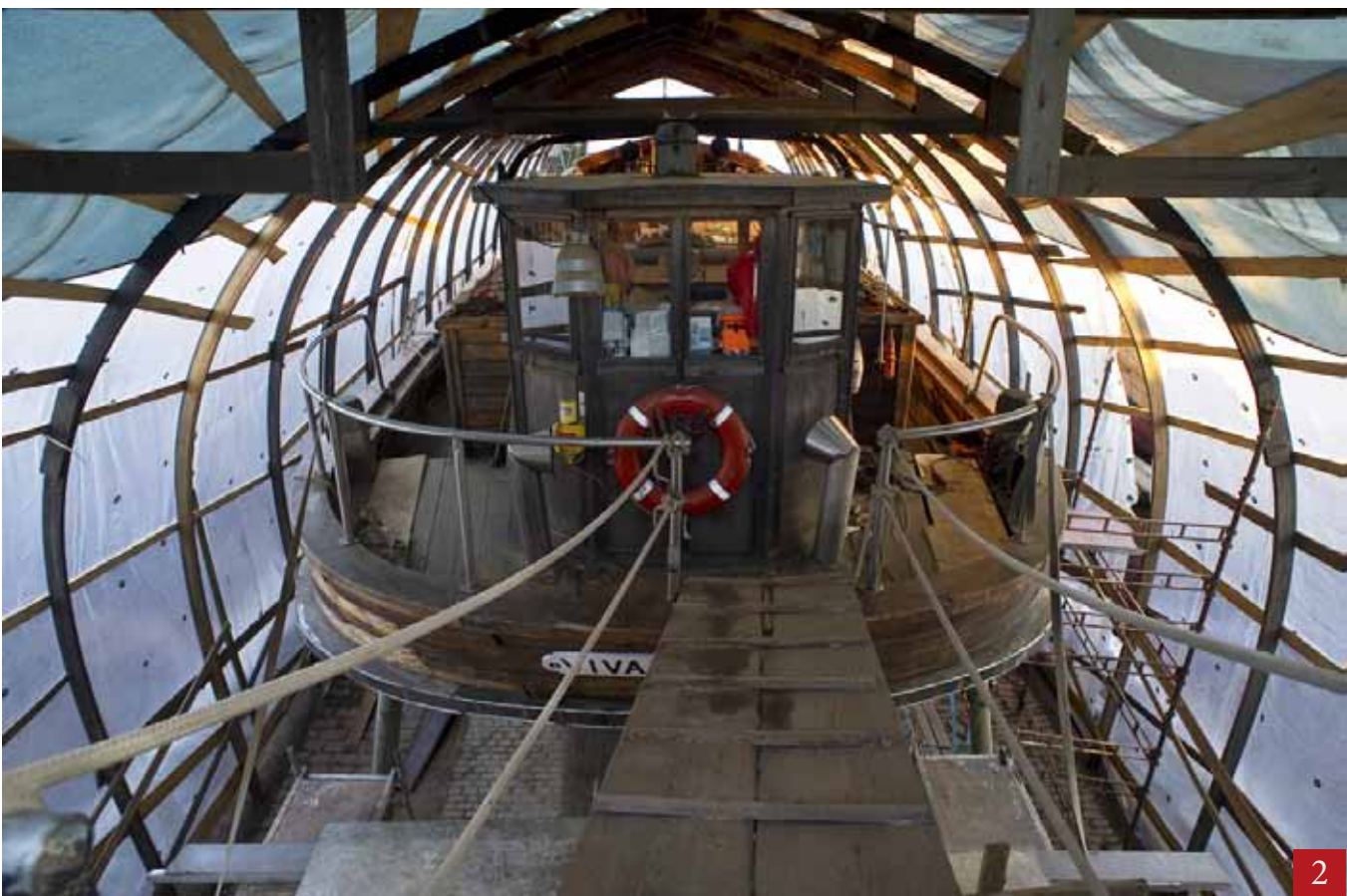
During the long boreal winter the ships are sheltered in the old galley dock of the fortress